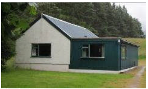
Fig. 2: Mallard cottage

2. A number of holiday cottages exist at present on the land which is the subject of the proposal for new and altered holiday accommodations. The site is accessed from the public road via the driveway to Invereshie House. Upon passing by the front and eastern (side) elevation of the main house, the access leads south eastwards towards the group of existing holiday units. The buildings on the site are surrounded by areas of mown lawn interspersed with groups of trees. The western, eastern and northern sides of the site are enclosed to varying degrees by woodland, while there are open views from the south west of the site over the adjacent Estate owned small private golf course.