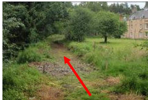
Fig. 10: Proposed new route