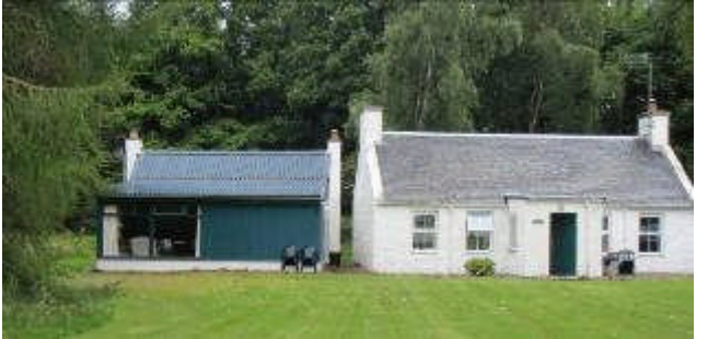
Fig. 4: Pheasant cottage (left) and Keeper's cottage