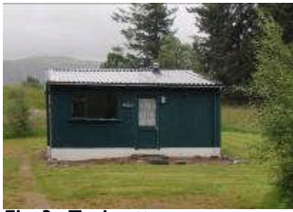
Fig. 3: Teal cottage